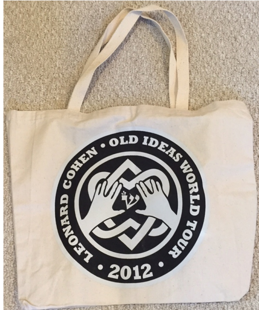
Merchandise accompanying Cohen's world tour